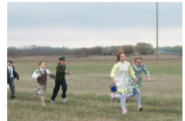
Grade 5 students from Shoal Lake School participating in Manitoba Day activities 2010.